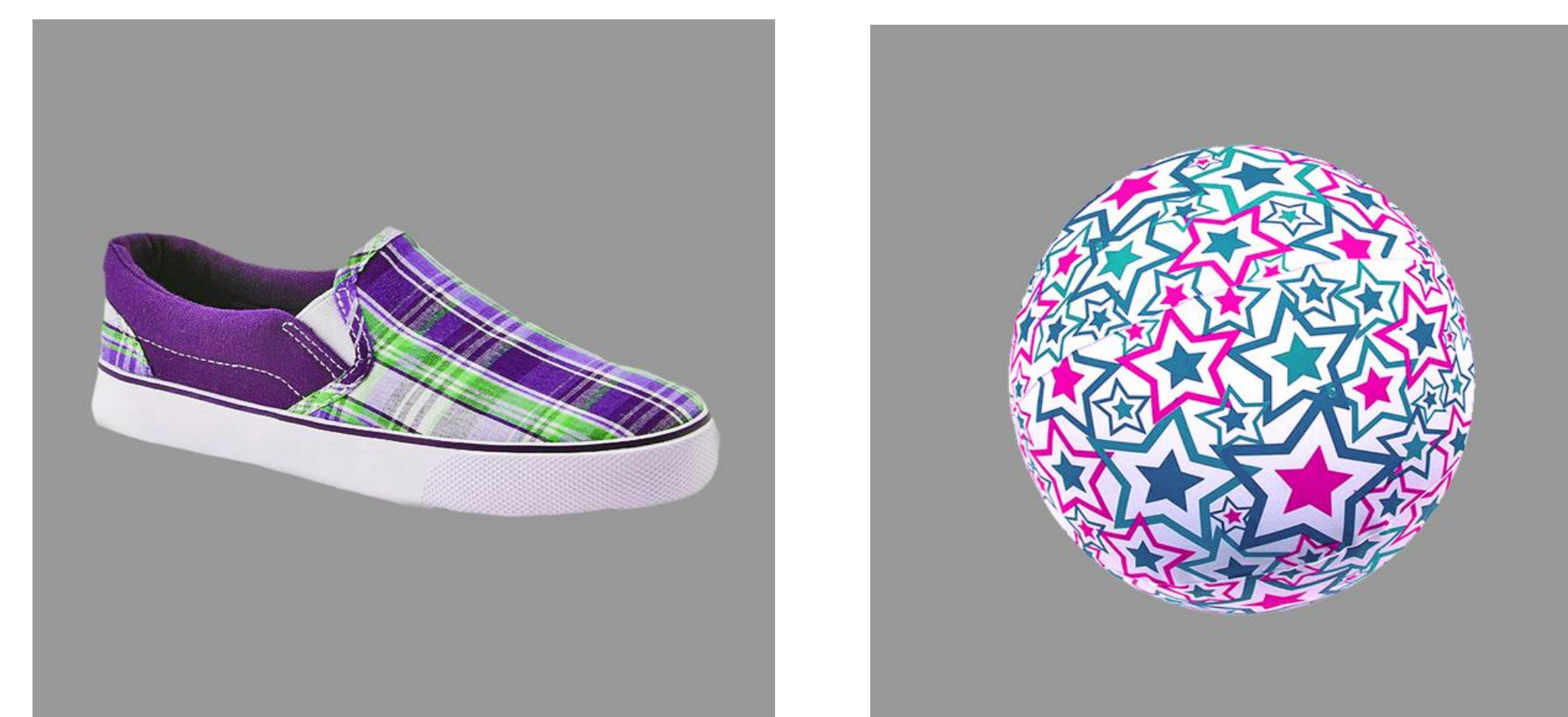
“Look at the ball.... That’s cool!”